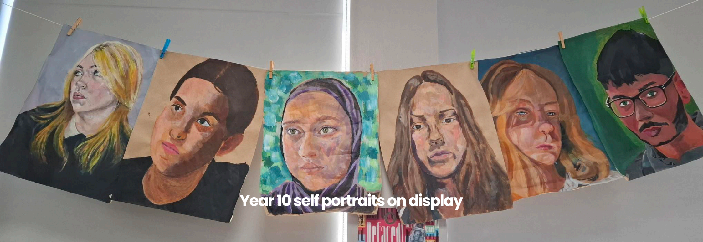
Year 10 self portraits on display