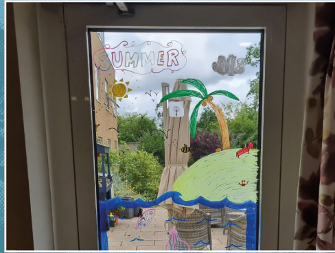
Decorating Manor Care Home