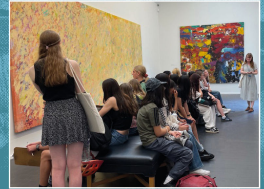
Sketching at the Gillian Ayres Exhibition