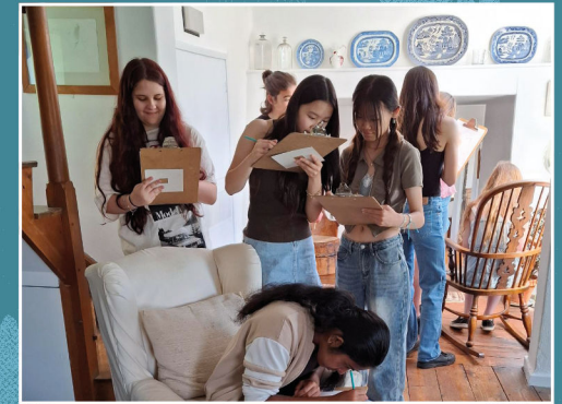
Behind the scenes at Kettles Yard