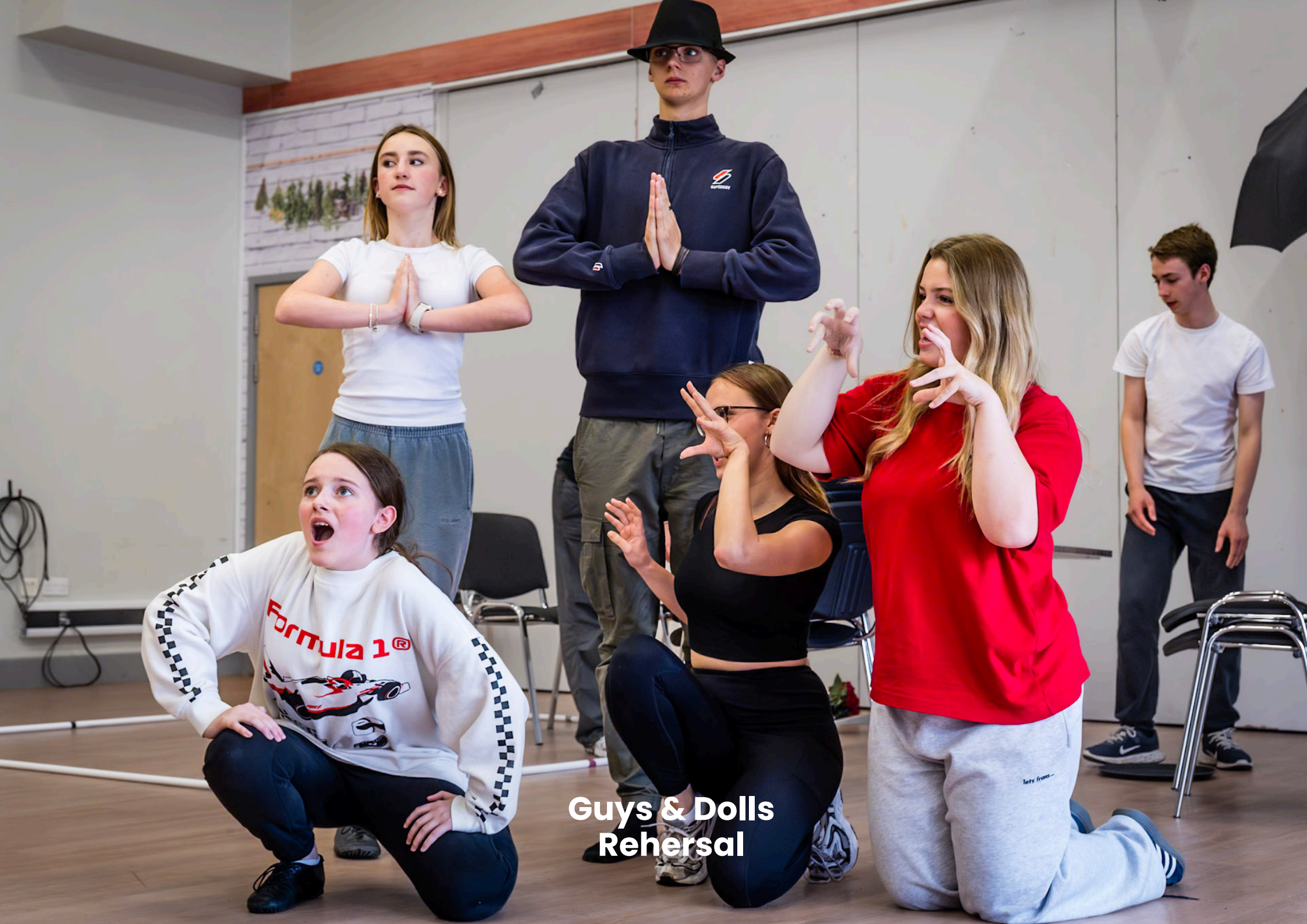
Guys & Dolls Rehearsal