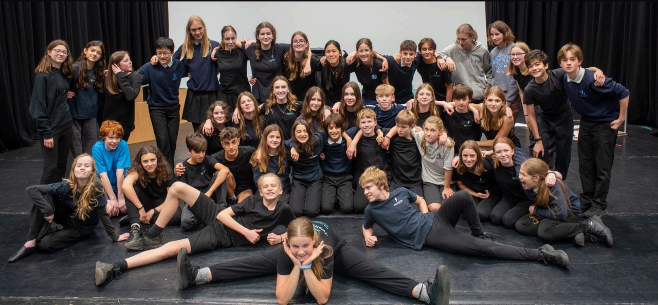
Lord of the Flies Cast