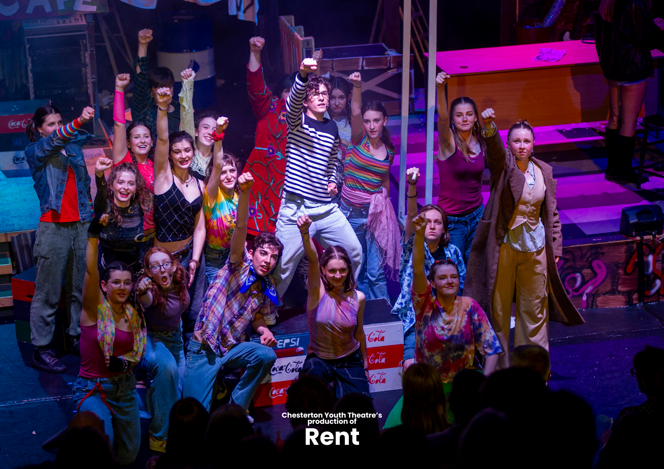
Chesterton Youth Theatre's production of Rent