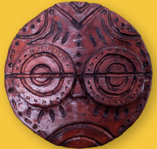
Year 7 Ceramic Masks