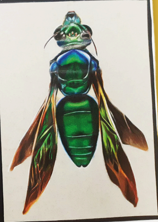
Michelle Croll, year 8, has been refining her colour pencil skills. These stunning drawings show strong use of blending, colour mixing and attention to detail. Very impressive!