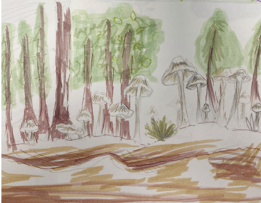
Isabella Jaramillo, Year 8