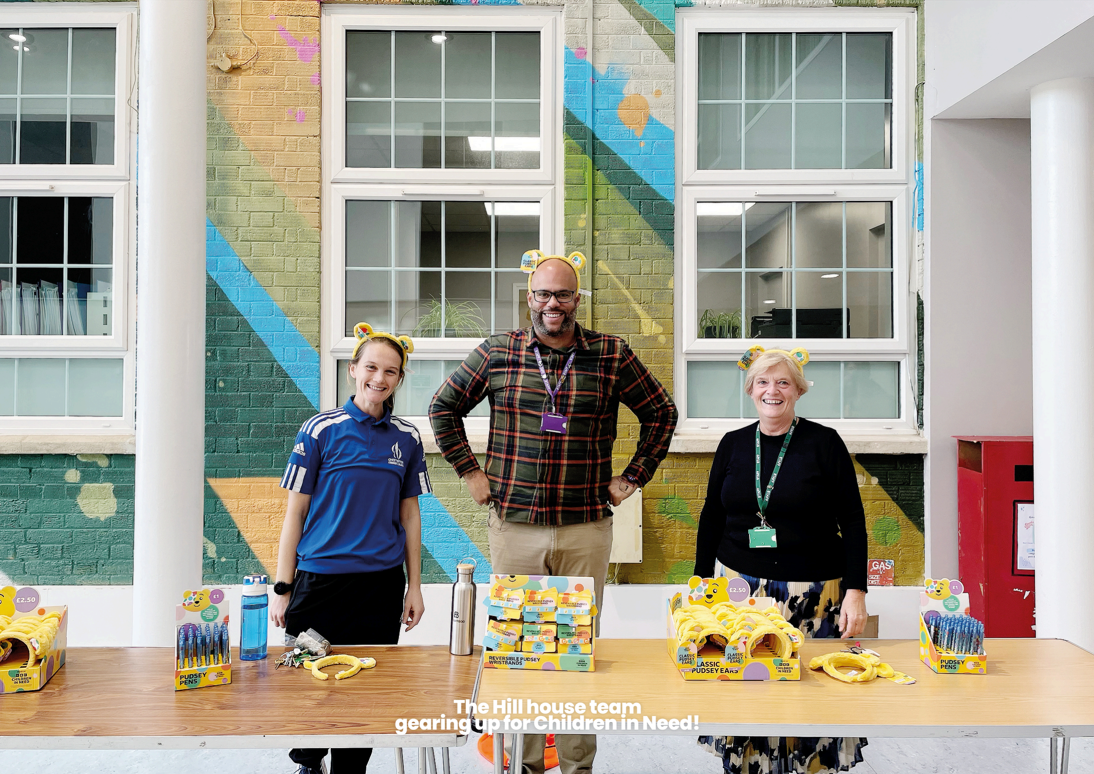
The Hill house team gearing up for Children in Need!